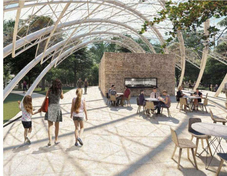
Concession Pavilion & Restrooms ( 975 - 37% )