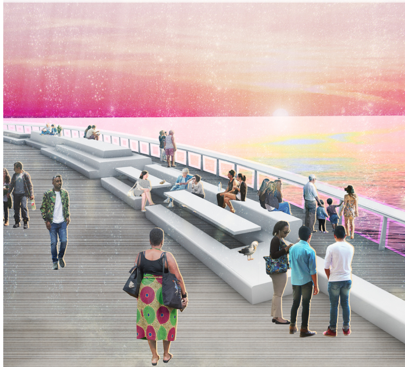
Sunset Boardwalk (77% - 2,029)