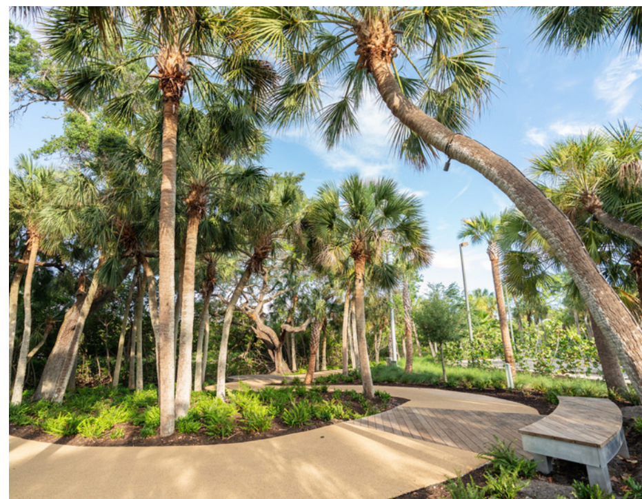
Oak and Palm Tree Hammock ( 1,002 - 38% )