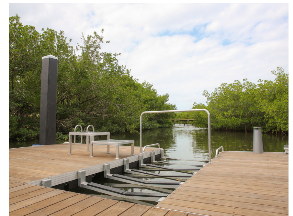
Paddling Launch ( 896 - 34% )